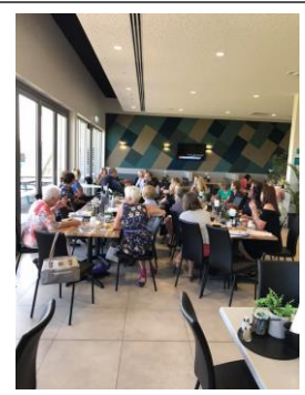
Meet & Greet Breakfast

In Town Centre Incorporated is a day centre facility that provides meals and promotes caring relationships and positive participation for all members of the community.